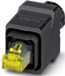
RJ45 plug-in connector, IP67, with push/pull interlocking (Version 14), plastic housing, for 10 Gbps, for 24 ... 27 AWG stranded conductors

Please be informed that the data shown in this PDF Document is generated from our Online Catalog. Please find the complete data in the user's documentation. Our General Terms of Use for Downloads are valid ( http://download.phoenixcontact.com )