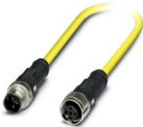
Sensor/Actuator cable, 3-position, PVC, yellow RAL 1021, Plug straight M12 SPEEDCON, A-coded, on Socket straight M12 SPEEDCON, A-coded, Cable length: 10 m

Please be informed that the data shown in this PDF Document is generated from our Online Catalog. Please find the complete data in the user's documentation. Our General Terms of Use for Downloads are valid ( http://phoenixcontact.com/download )