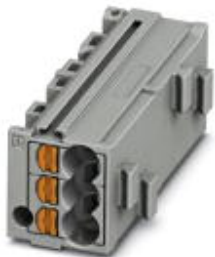
Image shows the version in gray

Please be informed that the data shown in this PDF Document is generated from our Online Catalog. Please find the complete data in the user's documentation. Our General Terms of Use for Downloads are valid ( http://phoenixcontact.com/download )