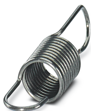
Spare recuperating spring

Please be informed that the data shown in this PDF Document is generated from our Online Catalog. Please find the complete data in the user's documentation. Our General Terms of Use for Downloads are valid ( http://phoenixcontact.com/download )