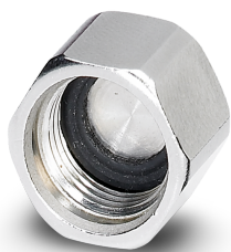
M12 metal sealing cap for unoccupied M12 plugs of the sensor/actuator cable, flush-type plugs and I/O devices in the field

Please be informed that the data shown in this PDF Document is generated from our Online Catalog. Please find the complete data in the user's documentation. Our General Terms of Use for Downloads are valid ( http://phoenixcontact.com/download )