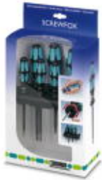
Screwdriver set, bladed/crosshead Pozidriv ® , 6-part, incl. rack

Please be informed that the data shown in this PDF Document is generated from our Online Catalog. Please find the complete data in the user's documentation. Our General Terms of Use for Downloads are valid ( http://download.phoenixcontact.com )