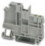
Screw flange, for screwing COMBI plugs, with the same structure and pitch as the relevant COMBI terminal blocks

Screw flange - UT 2,5-TWIN/1P-F - 3061172