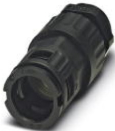
Cable gland, Pg thread, IP68/69k protection, with strain relief

Please be informed that the data shown in this PDF Document is generated from our Online Catalog. Please find the complete data in the user's documentation. Our General Terms of Use for Downloads are valid ( http://phoenixcontact.com/download )