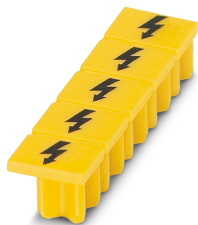
Warning cover, 5-pos., for terminal width: 5.2 mm

Please be informed that the data shown in this PDF Document is generated from our Online Catalog. Please find the complete data in the user's documentation. Our General Terms of Use for Downloads are valid ( http://phoenixcontact.com/download )