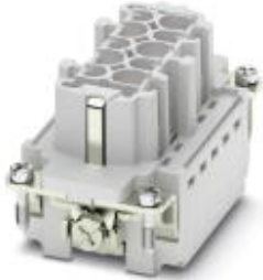
HEAVYCON socket insert, for 830 V (III/3), with 3 N/O contacts and 2 switch contacts, crimp connection

Please be informed that the data shown in this PDF Document is generated from our Online Catalog. Please find the complete data in the user's documentation. Our General Terms of Use for Downloads are valid ( http://phoenixcontact.com/download )