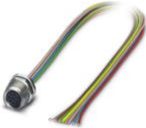
Sensor/actuator flush-type socket, 8-pos., M8, rear/screw mounting with M10 fastening thread, with 0.5 m TPE litz wire, 8 x 0.14 mm 2

Please be informed that the data shown in this PDF Document is generated from our Online Catalog. Please find the complete data in the user's documentation. Our General Terms of Use for Downloads are valid ( http://download.phoenixcontact.com )