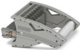
The figure shows the 14-pos. version

Test plug, With twist grip, Number of positions: 10, Width: 112.3 mm, Color: gray