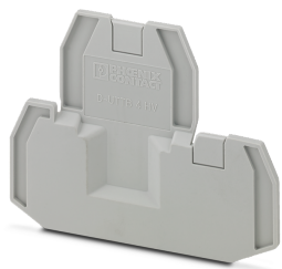
End cover, length: 75.6 mm, width: 2.2 mm, height: 57.5 mm, color: gray

Please be informed that the data shown in this PDF Document is generated from our Online Catalog. Please find the complete data in the user's documentation. Our General Terms of Use for Downloads are valid ( http://phoenixcontact.com/download )