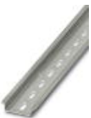
DIN rail, material: steel galvanized and passivated with a thick layer, perforated, height 7.5 mm, width 35 mm, length: 2000 mm

DIN rail perforated - NS 35/ 7,5 PERF 2000MM - 0801733