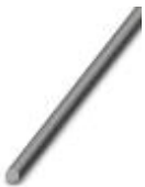
Connection pin, Length: 1000 mm, Color: gray