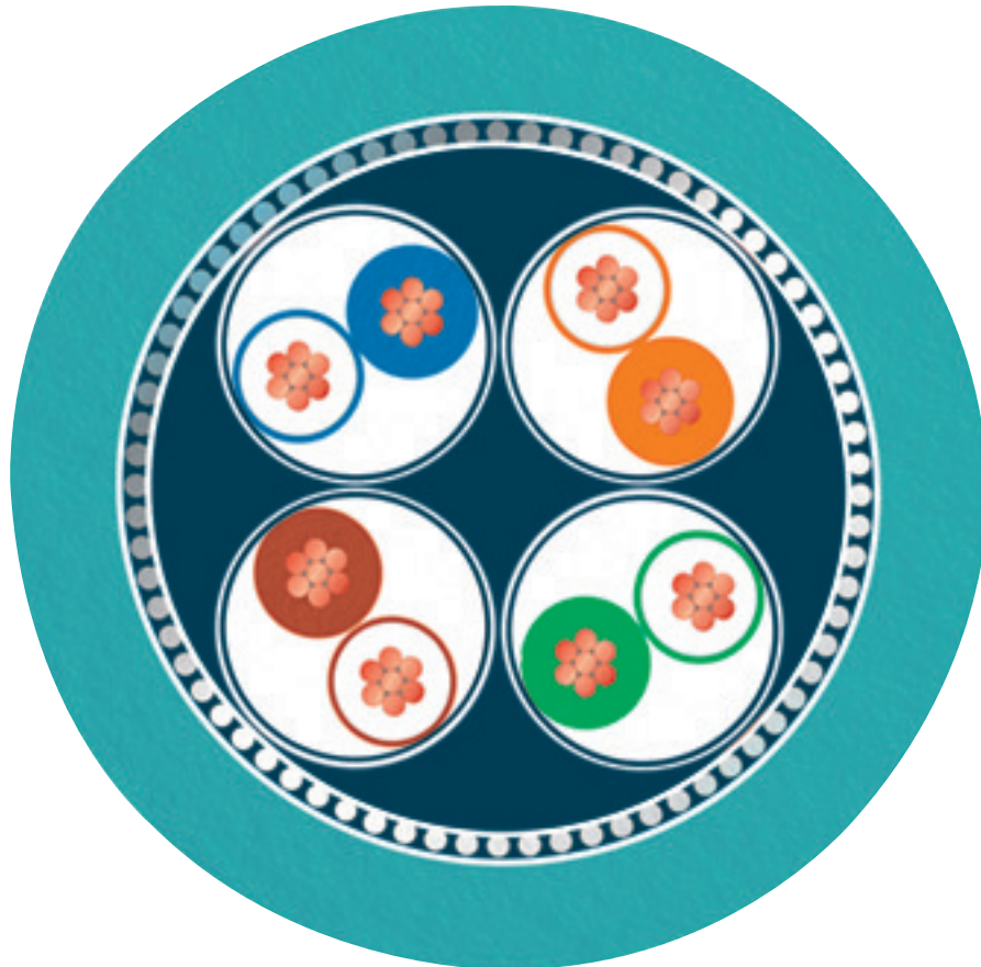
Cable cross section