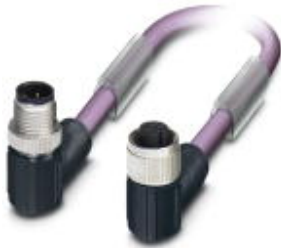
Sensor/Actuator cable, 5-position, PUR, Violet, RAL 4001, Plug angled M12, on Socket angled M12, Cable length: 2 m

Please be informed that the data shown in this PDF Document is generated from our Online Catalog. Please find the complete data in the user's documentation. Our General Terms of Use for Downloads are valid ( http://download.phoenixcontact.com )