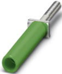
Female test connector, Color: green

Please be informed that the data shown in this PDF Document is generated from our Online Catalog. Please find the complete data in the user's documentation. Our General Terms of Use for Downloads are valid ( http://download.phoenixcontact.com )