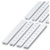
Zack marker strip, white, For terminal block width: 10 mm

Zack marker strip - ZB10:SO/CMS - 1050525