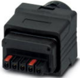
Connector component, Degree of protection: IP65, Number of positions: 5

Please be informed that the data shown in this PDF Document is generated from our Online Catalog. Please find the complete data in the user's documentation. Our General Terms of Use for Downloads are valid ( http://phoenixcontact.com/download )