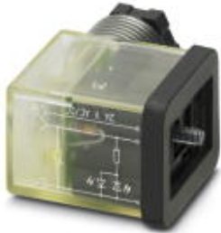
Valve connector, 3-pos., construction B, 1 LED, with protective circuit, screw connection, M16 cable gland

Please be informed that the data shown in this PDF Document is generated from our Online Catalog. Please find the complete data in the user's documentation. Our General Terms of Use for Downloads are valid ( http://download.phoenixcontact.com )