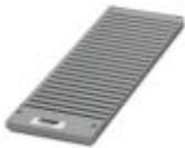
Plastic magazine for CMS-P1 plotter. Accepts 22 Zack band strips