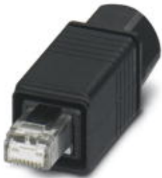
RJ45 connector, IP65/IP67, with push/pull interlocking (version 4), plastic housing, for 10 Gbps, for 24 ... 28 AWG stranded conductors

Please be informed that the data shown in this PDF Document is generated from our Online Catalog. Please find the complete data in the user's documentation. Our General Terms of Use for Downloads are valid ( http://phoenixcontact.com/download )