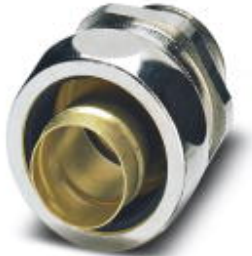
Cable gland made from brass with metric thread, IP65 protection

Please be informed that the data shown in this PDF Document is generated from our Online Catalog. Please find the complete data in the user's documentation. Our General Terms of Use for Downloads are valid ( http://phoenixcontact.com/download )