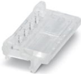
Ejector for COMBICON plug

Please be informed that the data shown in this PDF Document is generated from our Online Catalog. Please find the complete data in the user's documentation. Our General Terms of Use for Downloads are valid ( http://phoenixcontact.com/download )