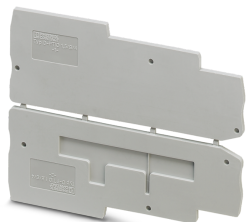
End cover, length: 90.8 mm, width: 2.2 mm, height: 33.8 mm, color: gray

Please be informed that the data shown in this PDF Document is generated from our Online Catalog. Please find the complete data in the user's documentation. Our General Terms of Use for Downloads are valid ( http://phoenixcontact.com/download )