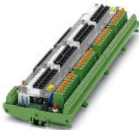
VARIOFACE output module, 32 channels for Yokogawa ADV 551, ADV 561 output modules.

Please be informed that the data shown in this PDF Document is generated from our Online Catalog. Please find the complete data in the user's documentation. Our General Terms of Use for Downloads are valid ( http://phoenixcontact.com/download )