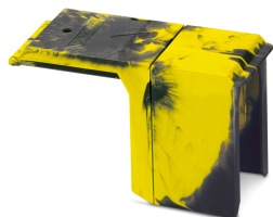
Covering hood, length: 164 mm, width: 49 mm, height: 33 mm, color: black/yellow

Please be informed that the data shown in this PDF Document is generated from our Online Catalog. Please find the complete data in the user's documentation. Our General Terms of Use for Downloads are valid ( http://phoenixcontact.com/download )