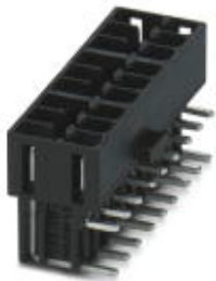
HSC header, touch-proof, 3 units, 18 connections, please note the positioning, color: black

Please be informed that the data shown in this PDF Document is generated from our Online Catalog. Please find the complete data in the user's documentation. Our General Terms of Use for Downloads are valid ( http://phoenixcontact.com/download )