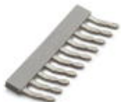
Insertion bridge, Number of positions: 10, Color: gray