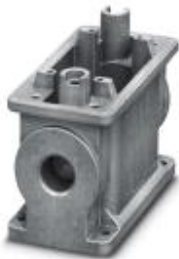
HEAVYCON ADVANCE B10 box mounting base, for M6 screw locking, salt-water-resistant aluminum, with 2 x M20 thread, without surface coating

Please be informed that the data shown in this PDF Document is generated from our Online Catalog. Please find the complete data in the user's documentation. Our General Terms of Use for Downloads are valid ( http://download.phoenixcontact.com )