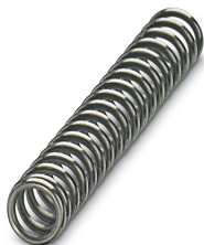
Coil spring for Lock & Release lever for ME-IO housing

Please be informed that the data shown in this PDF Document is generated from our Online Catalog. Please find the complete data in the user's documentation. Our General Terms of Use for Downloads are valid ( http://phoenixcontact.com/download )