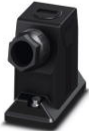
HEAVYCON ADVANCE B10 sleeve housing, with screw locking (Allen screw), plastic, height: 100 mm, with 1 x M32 thread, lateral cable outlet

Please be informed that the data shown in this PDF Document is generated from our Online Catalog. Please find the complete data in the user's documentation. Our General Terms of Use for Downloads are valid ( http://download.phoenixcontact.com )