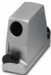
HEAVYCON ADVANCE EMV sleeve housing B24, with bayonet locking, height 100 mm, with 1xM32 thread, lateral cable outlet

Please be informed that the data shown in this PDF Document is generated from our Online Catalog. Please find the complete data in the user's documentation. Our General Terms of Use for Downloads are valid ( http://download.phoenixcontact.com )