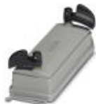
HEAVYCON ADVANCE IP65 protective cover B24, with bayonet locking, with retaining cord, diameter of retaining cord eyelet 3 mm

Protective covers - HC-B 24-TMB-SD-IP65 - 1690969