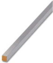
PEN conductor busbar, 6x6 mm, length: 1000 mm

Please be informed that the data shown in this PDF Document is generated from our Online Catalog. Please find the complete data in the user's documentation. Our General Terms of Use for Downloads are valid ( http://phoenixcontact.com/download )