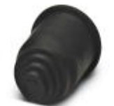
End sleeves, transition sleeves, from hose to cable

Transition sleeve from hose to cable - WP-EC TPE HF 15,8 BK - 3240976