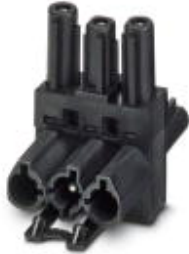
T-distributor with 2 sockets and one connector for series connection, black, 3-pos.

Please be informed that the data shown in this PDF Document is generated from our Online Catalog. Please find the complete data in the user's documentation. Our General Terms of Use for Downloads are valid ( http://phoenixcontact.com/download )