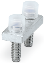
Fixed bridge, pitch: 20 mm, color: silver

Please be informed that the data shown in this PDF Document is generated from our Online Catalog. Please find the complete data in the user's documentation. Our General Terms of Use for Downloads are valid ( http://phoenixcontact.com/download )