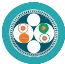
PUR ETHERNET 2x2 FLEX [93E]