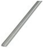
Continuous plug-in bridge, color: gray

Continuous plug-in bridge - FBST 500-PLC GY - 2966838