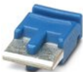
Single plug-in bridge, color: blue

Single plug-in bridge - FBST 6-PLC BU - 2966812