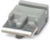
Single plug-in bridge, color: gray

Single plug-in bridge - FBST 6-PLC GY - 2966825