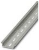
DIN rail perforated, acc. to EN 60715, material: Steel, galvanized, passivated with a thick layer, Standard profile, color: silver

DIN rail perforated - NS 35/ 7,5 PERF 2000MM - 0801733