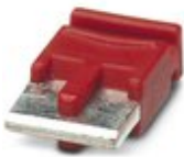
Single plug-in bridge, color: red

Single plug-in bridge - FBST 6-PLC RD - 2966236