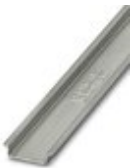
DIN rail, unperforated, acc. to EN 60715, material: Steel, galvanized, passivated with a thick layer, Standard profile, color: silver

DIN rail, unperforated - NS 35/ 7,5 UNPERF 2000MM - 0801681