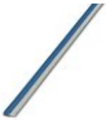
Continuous plug-in bridge, color: blue

Continuous plug-in bridge - FBST 500-PLC BU - 2966692