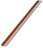
Continuous plug-in bridge, color: red

Continuous plug-in bridge - FBST 500-PLC RD - 2966786