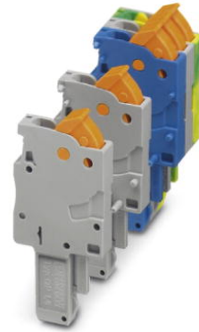
Illustration shows various versions of the product (left, center and right element) in different color combinations

http://eshop.phoenixcontact.de/phoenix/treeViewClick.do?UID=3051014