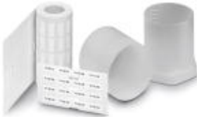
The figure shows the EML (20X8)R product variant

Label, Roll, white, Unlabeled, Can be labeled with: Thermomark R, Thermomark X, Thermomark S, Mounting type: Adhesive, Lettering field: 17.5 x 8 mm