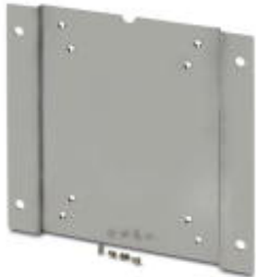
Mounting plate for FL SWITCH 30... and FL SWITCH 40... 16-port switches

Please be informed that the data shown in this PDF Document is generated from our Online Catalog. Please find the complete data in the user's documentation. Our General Terms of Use for Downloads are valid ( http://phoenixcontact.com/download )