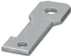
Plate for fixing the FLT-ISG-100-EX isolating spark gap to a flange, drill hole diameter of 14 mm.

Please be informed that the data shown in this PDF Document is generated from our Online Catalog. Please find the complete data in the user's documentation. Our General Terms of Use for Downloads are valid ( http://phoenixcontact.com/download )