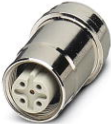
Sensor/actuator flush-type socket, 5-pos., M12, B-coded, front/press-in mounting, with straight solder connection

Please be informed that the data shown in this PDF Document is generated from our Online Catalog. Please find the complete data in the user's documentation. Our General Terms of Use for Downloads are valid ( http://download.phoenixcontact.com )