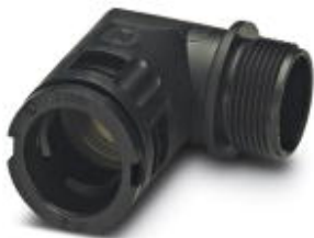
Cable gland, Pg thread, IP68/69k protection, angled

Please be informed that the data shown in this PDF Document is generated from our Online Catalog. Please find the complete data in the user's documentation. Our General Terms of Use for Downloads are valid ( http://phoenixcontact.com/download )