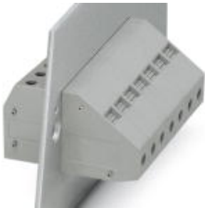
The illustration shows the gray version

Please be informed that the data shown in this PDF Document is generated from our Online Catalog. Please find the complete data in the user's documentation. Our General Terms of Use for Downloads are valid ( http://download.phoenixcontact.com )