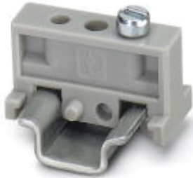
End clamp, width: 6.2 mm, color: gray

Please be informed that the data shown in this PDF Document is generated from our Online Catalog. Please find the complete data in the user's documentation. Our General Terms of Use for Downloads are valid ( http://download.phoenixcontact.com )