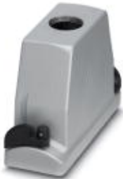
HEAVYCON ADVANCE EMV sleeve housing B24, with bayonet locking, height 100 mm, with 1x M40 thread, straight cable outlet

Please be informed that the data shown in this PDF Document is generated from our Online Catalog. Please find the complete data in the user's documentation. Our General Terms of Use for Downloads are valid ( http://download.phoenixcontact.com )