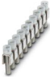
Fixed bridge, Number of positions: 10, Color: silver

Please be informed that the data shown in this PDF Document is generated from our Online Catalog. Please find the complete data in the user's documentation. Our General Terms of Use for Downloads are valid ( http://download.phoenixcontact.com )