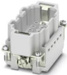
HEAVYCON pin insert, for 830 V (III/3), with 3 N/O contacts and 2 switch contacts, crimp connection

Please be informed that the data shown in this PDF Document is generated from our Online Catalog. Please find the complete data in the user's documentation. Our General Terms of Use for Downloads are valid ( http://phoenixcontact.com/download )